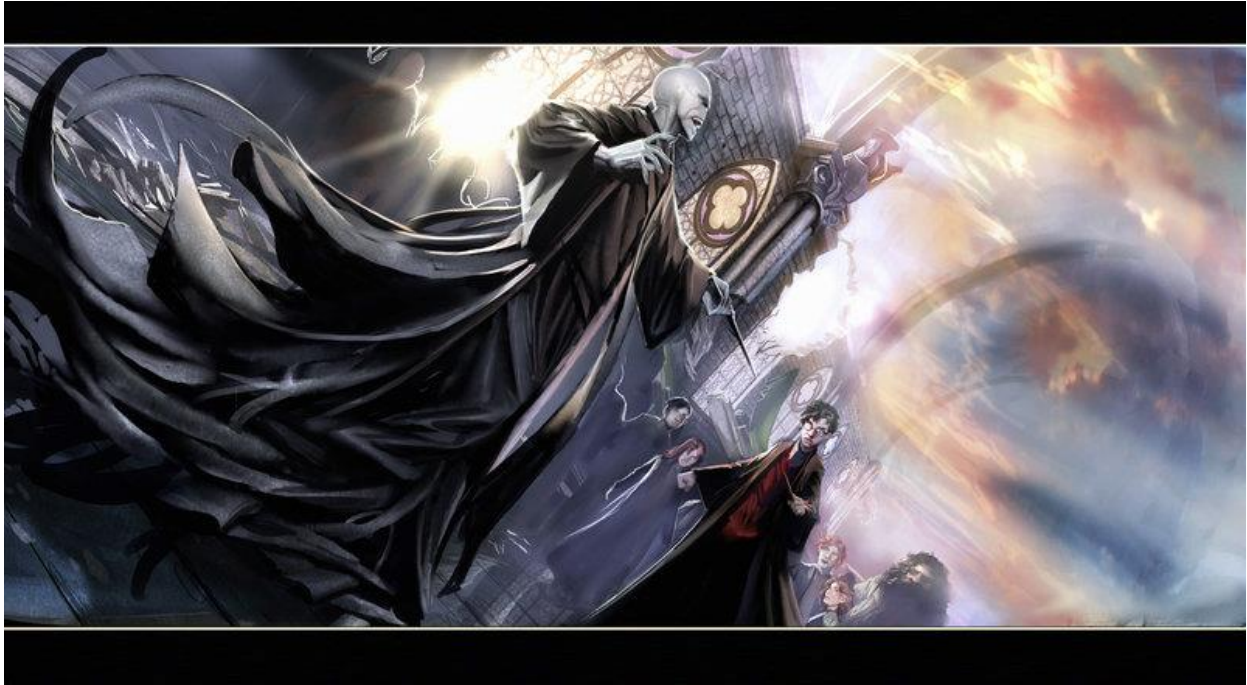
Figure 3: a digital painting, depicting a scene from the seventh and final book, featuring Lord Voldemort and Harry Potter at the Battle of Hogwarts (Sejic, 2009).

paintings. Fanvids re-imagine or analyzes themes from the series by slicing footage from the film and adapting it into a music video that conveys a specific emotion pertinent to the theme (Fiesler, 2008; Trombley, 2007).