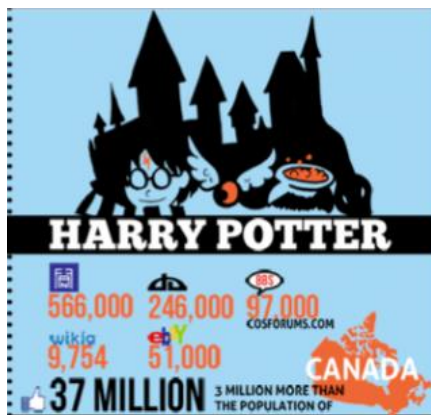
Figure 1: numerical data for Harry Potter fandom on several online entities (Cheezburger, 2011).

The modern, digital act of reading blogs and participating in online fandom parallels the former generations' affirmation of "seeing your fellow Americans reading the same newspaper as you" (Tocci, 2009, p. 71); when fans understand that others are as equally involved in the shared text, their investment in the fandom is validated. An infographic from meme-driven blog Cheezburger (2011) analyzed the numbers of the online presence of several fandoms; as of December 16, 2011, Harry Potter proved to be the most popular fandom on Facebook, with 11 million more likes than the Twilight series. There were also more Potter-themed fan fiction stories than other fandoms, and entries for fanart placed second only to Pokemon .